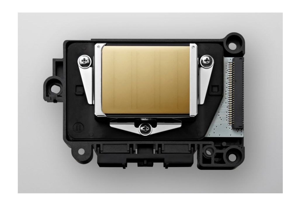
Advanced MicroPiezo AMC Printhead