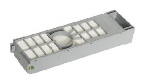
Replacement Ink Maintenance Tank