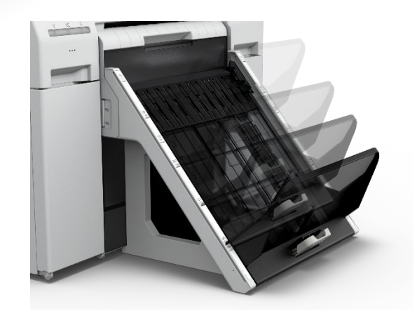
Adjustable Output Print Tray