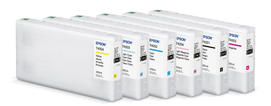
200 mL UltraChrome D6-S Ink Cartridges Standard Edition ink set shown (no ink cartridges included in-box)