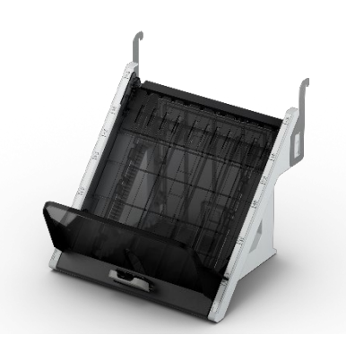
New Rigid Print Tray